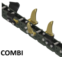
COMBI Mixed Terrain