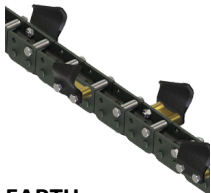
EARTH Soft Ground